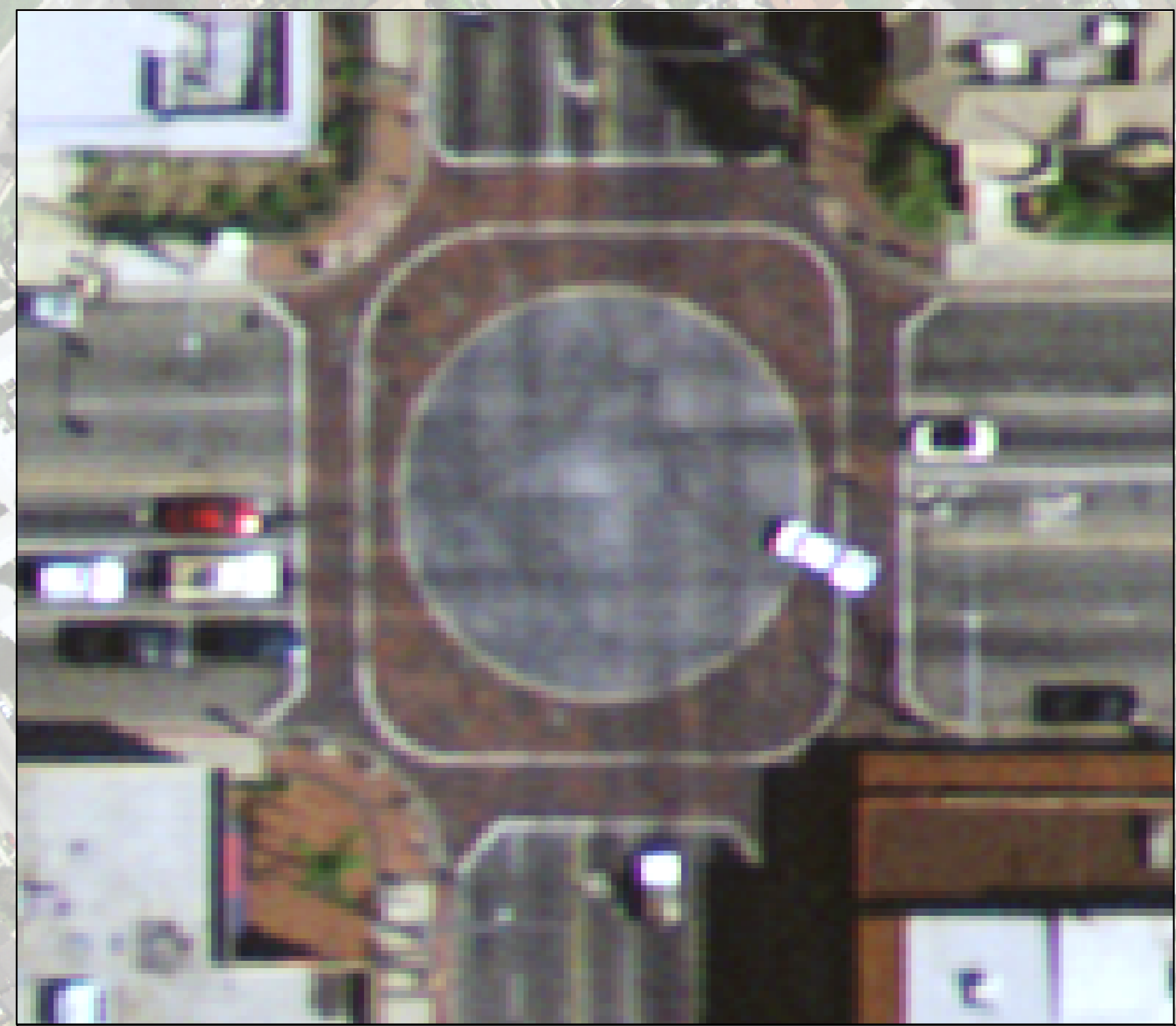
DETAIL ENHANCED INTERSECTION